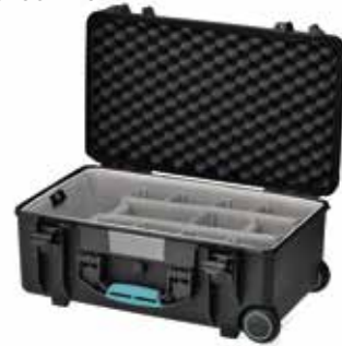
Thermoformed, spaces are perfectly optimized