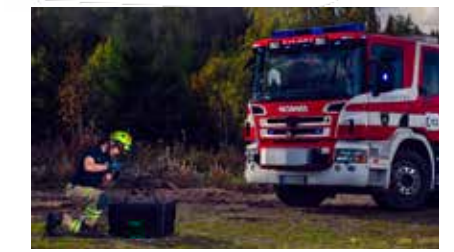
Medical | Firefighter | Emergency