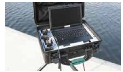
High-tech | Industrial | Electronics