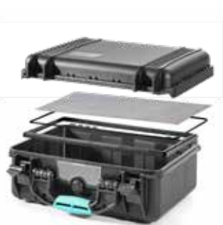
Panel not included