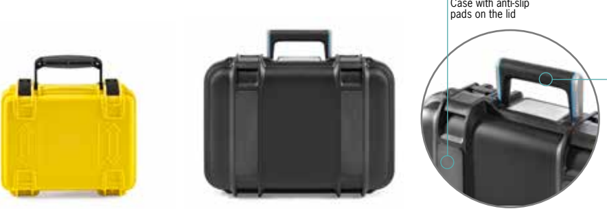
Case with anti-slip pads on the lid

Our know-how and expertise allow us to meet any customers' requirement, either OEM, B2B or B2C