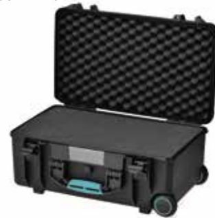
The foam is pre-scored in tiny cubes