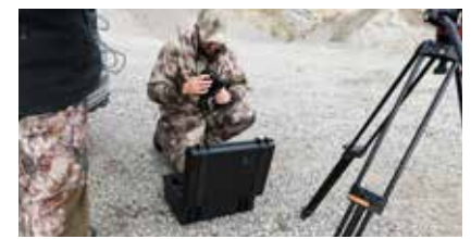
Military | Government police law enforcement