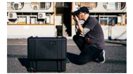
Imaging | Broadcasting