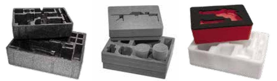
injection inlays milled and water cut sponge hi-visibility inlays

We can create any custom foam interiors to provide the utmost protection for your equipment