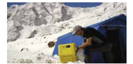
Outdoor | Diving | Marine