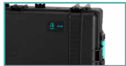
Body: TTX01®, enhanced compound based on pp, balanced with additional high performance resins. Available on demand flame resistant compounds Hardware: Stainless steel