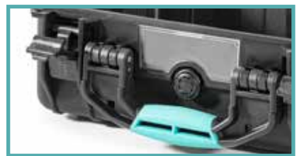
Handle: PP+SEBS Latches: PA + GF